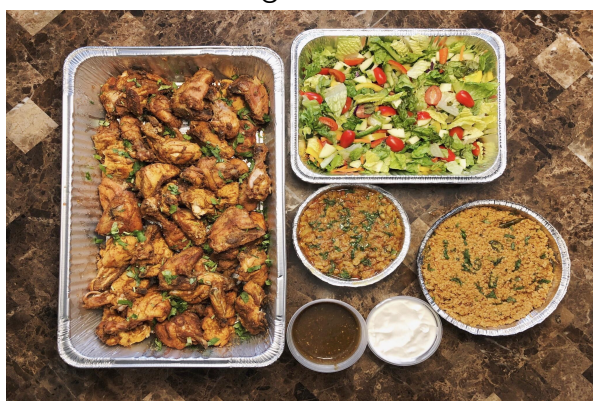
Lahori Charcha & Mash Daal